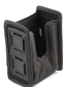
HLS-P080 Universal Holster (HLS-8000)