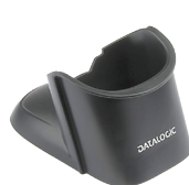
HLD-P080 Desk/Wall Holder (HLD-8000)