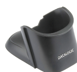
HLD-P080 Desk/Wall Holder (HLD-8000)