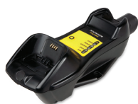
BC9030-BT Base/Charger, Multi-Interface